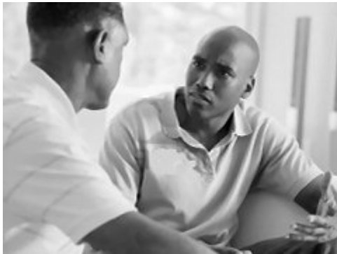
Sharing our gender and sexuality issues with people close to our hearts can be intimidating

Article appeared in Polare magazine: February 2000 Last Update: October 2013 Last Reviewed: September 2015