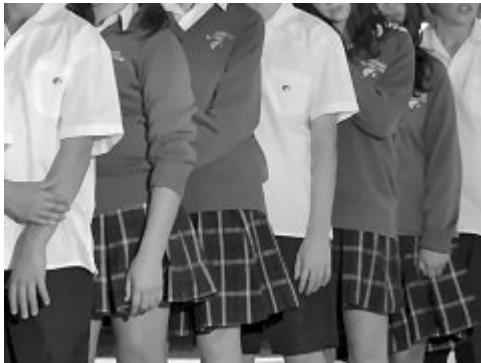
I was female and was wrongly dressed, as the girls were wearing skirts, but I was wearing trousers ...

Article appeared in Polare magazine: February 2000 Last Update: October 2013 Last Reviewed: September 2015