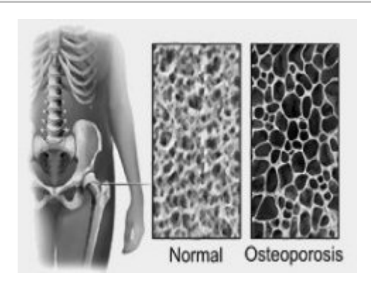
Osteoporosis: the bones of an individual become less dense.

Article appeared in Polare magazine: April 1996 Last Update: October 2013 Last Reviewed: September 2015