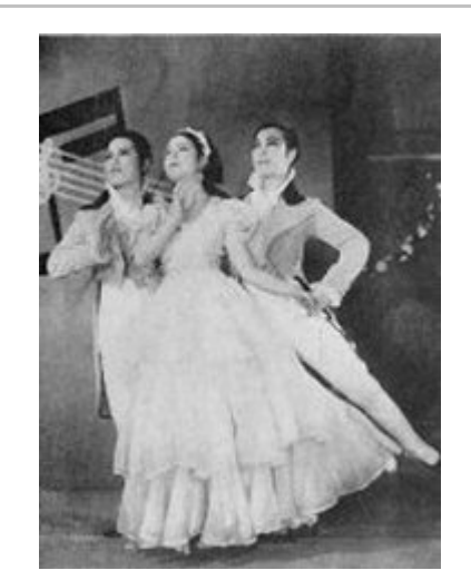
A Musumeyaku is flanked by two Otokoyaku, circa 1935.

Article appeared in Polare magazine: April 1996 Last Update: October 2013 Last Reviewed: September 2015