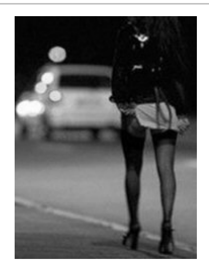
A range of societal factors may place some transgenders at a disadvantage when trying to negotiate safe sex.

Article appeared in Polare magazine: April 1996 Last Update: October 2013 Last Reviewed: September 2015