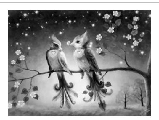
I'm very happy. I love [Wayne] very much.

Article appeared in Polare magazine: April 1996 Last Update: October 2013 Last Reviewed: September 2015