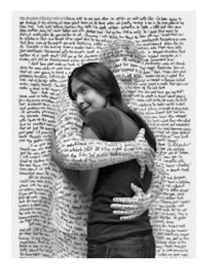
Our community needs to change the minds of those who change the laws, we will struggle to do this, until we settle on a standard use of words to express to the legislators our socio-biological predicament.

Article appeared in Polare magazine: June 2003 Last Update: October 2013 Last Reviewed: September 2015