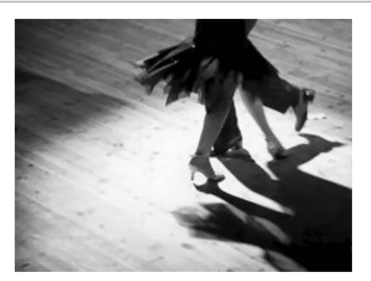
I show such joy in dancing.

Article appeared in Polare magazine: June 2003 Last Update: October 2013 Last Reviewed: September 2015